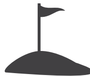
Sports & entertainment